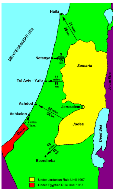
Distances Between Israeli Population Centers and Pre-1967 Armistice Lines

British withdrew, Israel immediately declared its statehood. The Arab states immediately declared war on the fledgling nation. The armies of Lebanon, Syria, Jordan, Iraq and Egypt (supported also by Saudi Arabia) invaded Israel. Miraculously, Israel survived the annihilation attempt but the conflict continues to this day. By the end of this War of Independence, biblical Judea and Samaria, began to be called the 'West bank' (of the Jordan River). This is the area in which the Palestinians, the United Nations and much of the world wish to establish a Palestinian State. As you see from the map, the distances to the major cities is very short.